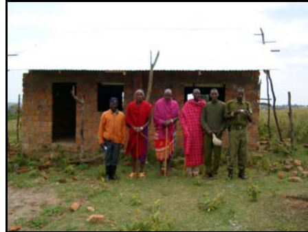
Elders in Front of New Classroom