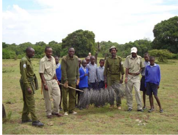
Team Effort Removing Wire Fence