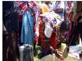
Masai Mother Mixing Insta Porridge