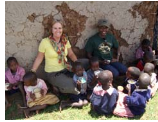
Children Enjoying Their First Meal at School

I am grateful for the extra time they have given me, and the children, to make this happen. The Masai community is very enthusiastic to introduce the nutrition programme to many more schools and I will have further meetings with community and elders when I am in Kenya to see if this can become a reality. If anyone is interested in supporting this nutrition programme please let me know. I would be most grateful. It costs approx $45.00 to feed one child for a year once the water tanks, etc. are in place. A full budget is available for anyone interested.