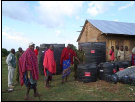
Delivering Water Tanks to School

This project was completed at Oloomongi Nursery school. We installed two large water tanks with water being collected off the tin roofs of the newly constructed classrooms, which we also funded and supervised. There are some very happy children and parents!