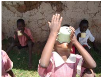
Child Finishing Insta Porridge

I am grateful for the extra time they have given me, and the children, to make this happen. The Masai community is very enthusiastic to introduce the nutrition programme to many more schools and I will have further meetings with community and elders when I am in Kenya to see if this can become a reality. If anyone is interested in supporting this nutrition programme please let me know. I would be most grateful. It costs approx $45.00 to feed one child for a year once the water tanks, etc. are in place. A full budget is available for anyone interested.