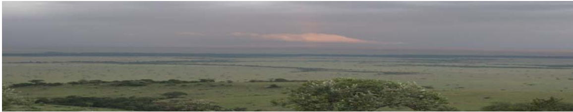
Masai Mara Aerial View