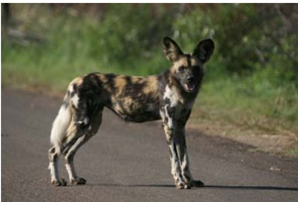
Wild Dog

As many of you know from your past safaris, we often like to use private 'Bush Homes', which are situated on large ranches, or Conservancies, that in many cases adjoin the game reserves. These properties are hosted by friends/colleagues whom we have known for many years. They are all extremely knowledgeable and professional with a sincere love and understanding of their particular piece of Kenya. As these properties are located on private land outside the parks, game viewing can be done in traditional safari vehicles or you may be able to venture out on a guided walk which is extremely exciting as all your senses are heightened while on equal footing with the animals around you. In some places, you may also ride horses or camels a unique way to see the beautiful terrain that Kenya has to offer.