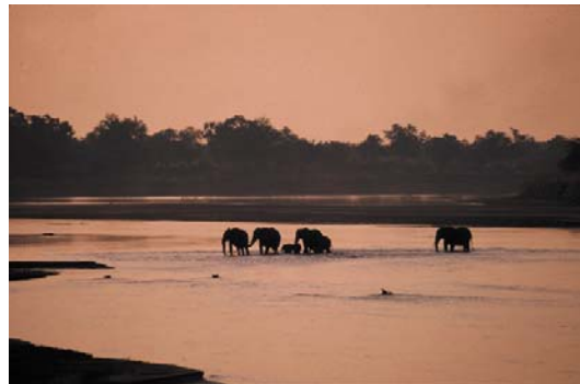
Elephants in the Luangwa River