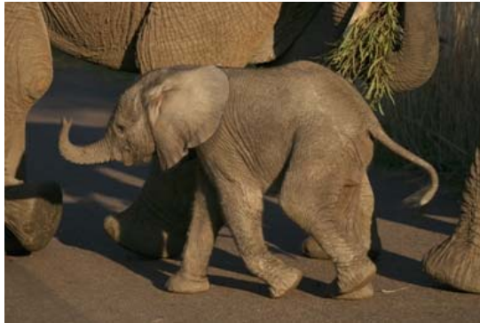
Two week old Elephant by Shawn Catterall