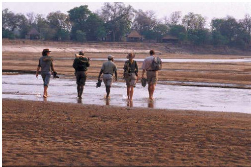
Walking in Zambia